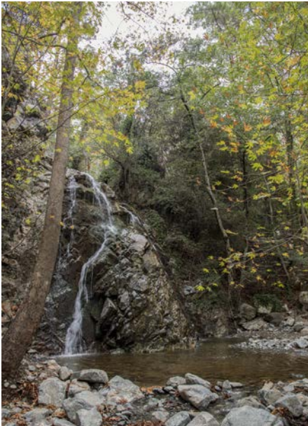
Hantara Waterfalls Foini

personalities such as the king of Egypt Farouk and the president of Israel Ezer Vaisman.