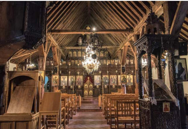
Agia Marina Kyperounta

of the Holy Cross, with murals dating from 1521, which has actually been turned into a museum. An interesting feature of the church is its uneven wooden roof, which has the shape of a capital L.