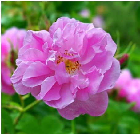
Wild Rose, Agros