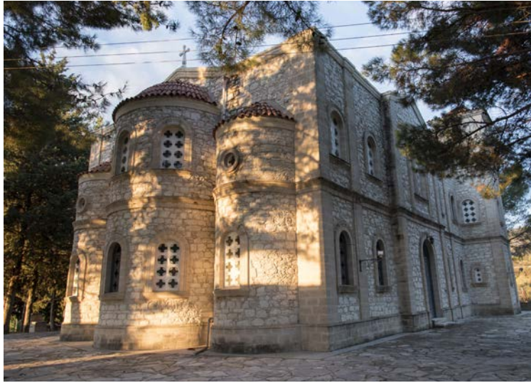
Agios Ioannis Theologos church, Pera Pedi

In the centre of Pera Pedi, you will find the historical church of Saint Nicolas, built in 1776, where two portable icons are kept, that of the Virgin Mary of the 16th century and that of St. John the Evangelist which dates back to 1550.