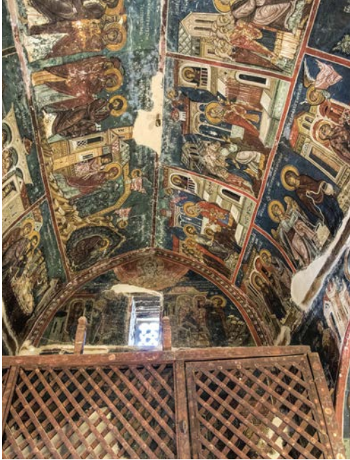
Timios Stavros, Pelendri

Travel north from the Polemidia roundabout towards Troodos on the B8 and take the right exit to Apesia and on to Korfi, which was built in the 1970s to house the villagers after landslides caused a lot of damage, rendering the original settlement unsafe.