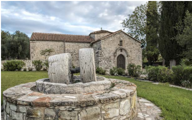
Wheat Mill Kouka

Then drive south past Alassa, located only 12 kilometres from Lemesos and offering beautiful views of the Kouris dam.